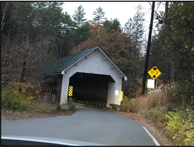
ANOTHER COVERED BRIDGE