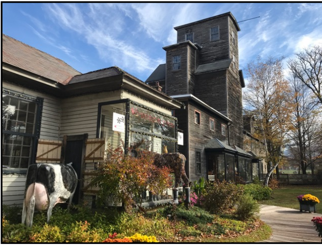
A VISIT TO BENNINGTON POTTERY