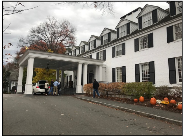
ABOVE AND BELOW: LUNCH AT THE WOODSTOCK INN AND RESORT PLUS A COVERED BRIDGE RIGHT IN THE MIDDLE OF TOWN