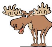
DEBBIE & TIM