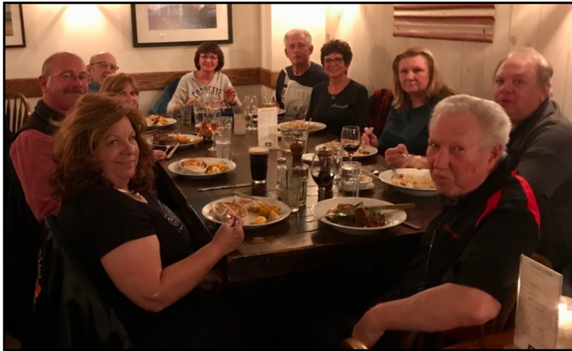
ABOVE: THE ANCHOR SEAFOOD RESTAURANT FOR DINNER, WILMINGTON VT