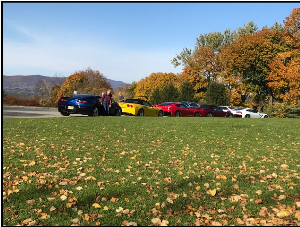
BELOW/RIGHT: OUR VETTES AND BANNER