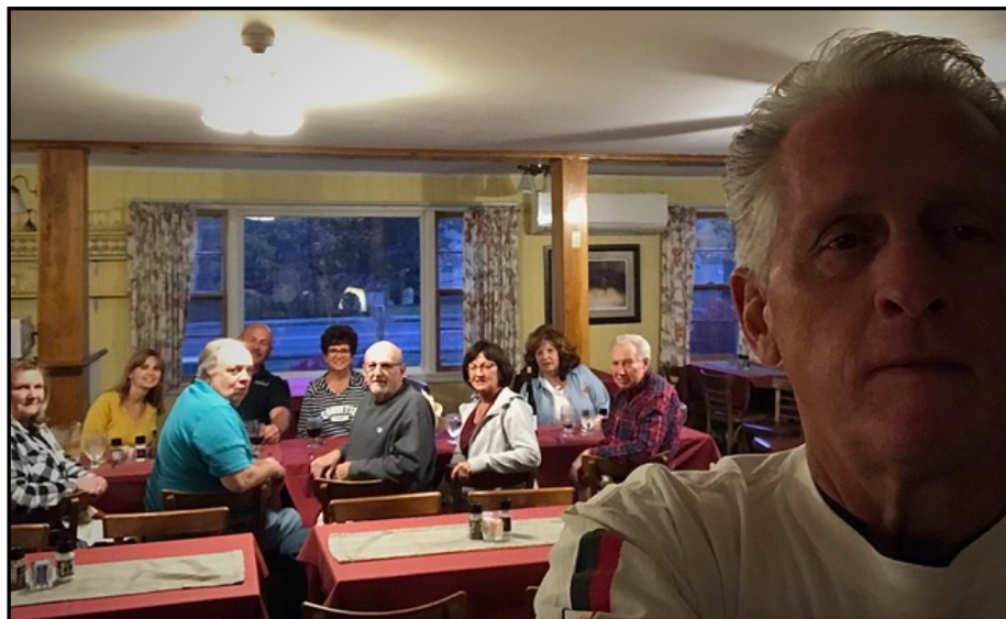
BELOW: AT THE GRAY GHOST INN, WEST DOVER, VT FOR DINNER